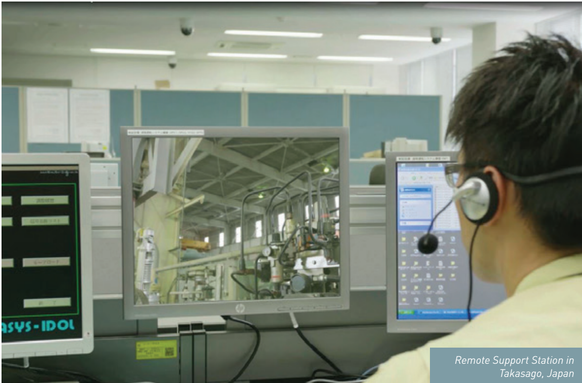
Remote Support Station in Takasago, Japan

balance weight calculations can now be accomplished by specialized subject-matter experts without requiring them to travel to the plant. It is also important to be able to remotely introduce control settings changes, software patches, logic modifications and other crucial updates. During the COVID-19 pandemic, which limited personnel on site to only those who are essential, the RMCs were able to give procedures for controls updates to the on-site staff to manage the update and support any issues remotely.