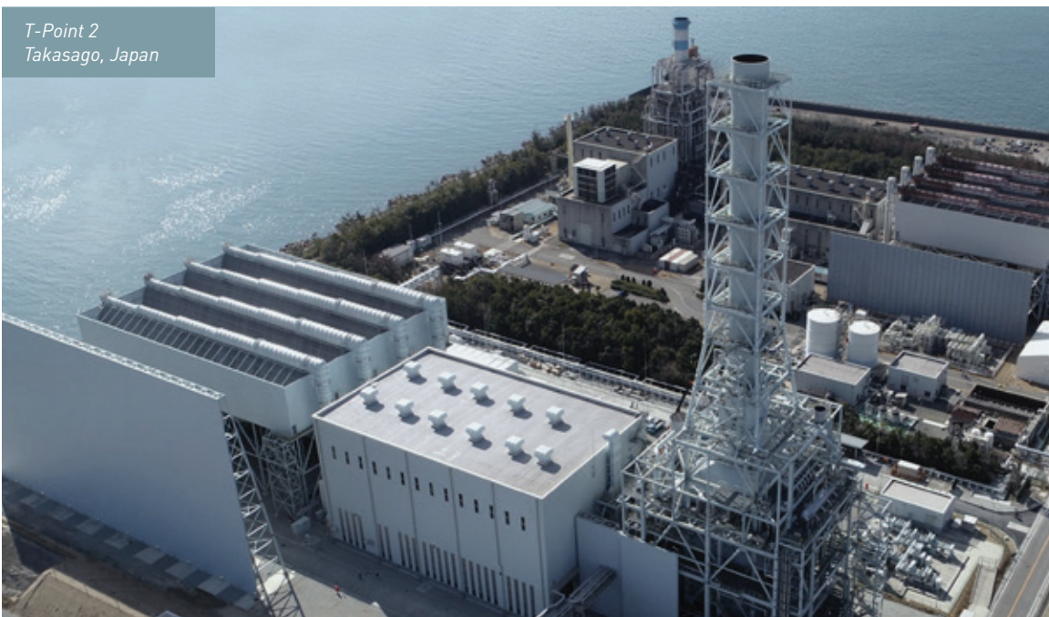
T-Point 2 Takasago, Japan

Mitsubishi Power is providing total plant O&M for its own power plant at T-Point 2 and continues to gain invaluable experience in applying remote operation and maintenance technologies that are minimizing the need for on-site manpower and leveraging remote technical expertise on this fully integrated GTCC.