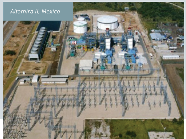
Altamira II, Mexico

Altamira II, located in Mexico, had a planned major outage scheduled for March 2020. The COVID-19 pandemic made it difficult to have the appropriate crew on site for the inspection and maintenance. Through a technical relationship between the plant owner and Mitsubishi Power, the team at the RMC was able to access the data, through an already established, cybersecure channel, to suggest a move of the planned outage to September, defining a new condition-based maintenance interval and providing condition-monitoring priorities for the interim period. This allowed for flexibility and time to plan and better support the outage around the global crisis.