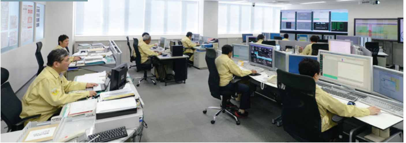
Remote Monitoring Center Takasago, Japan

coming on and off the site can provide cost savings, reduce delays and allow plants more flexibility as they cope with workforce challenges and budget concerns.